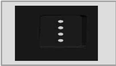
LED Battery Light Indicator