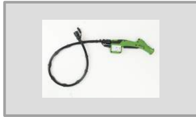
Electrostatic sprayer wand