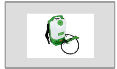
Backpack with Handle