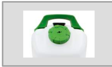
Backpack Tank Cap