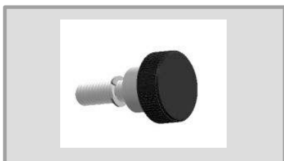
Door Lock Knob