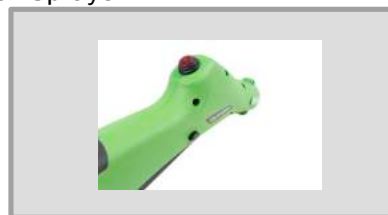
Electrostatic Red Button