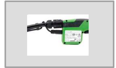
Quick Release Connectors