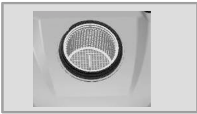
Backpack Tank Screen